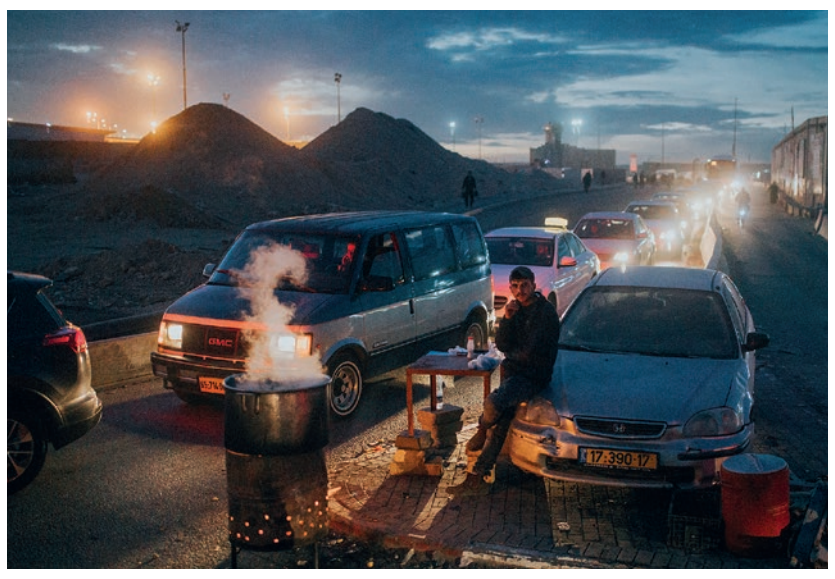
A man waiting by the cars going through a checkpoint in Ramallah, Palestinian Territories.