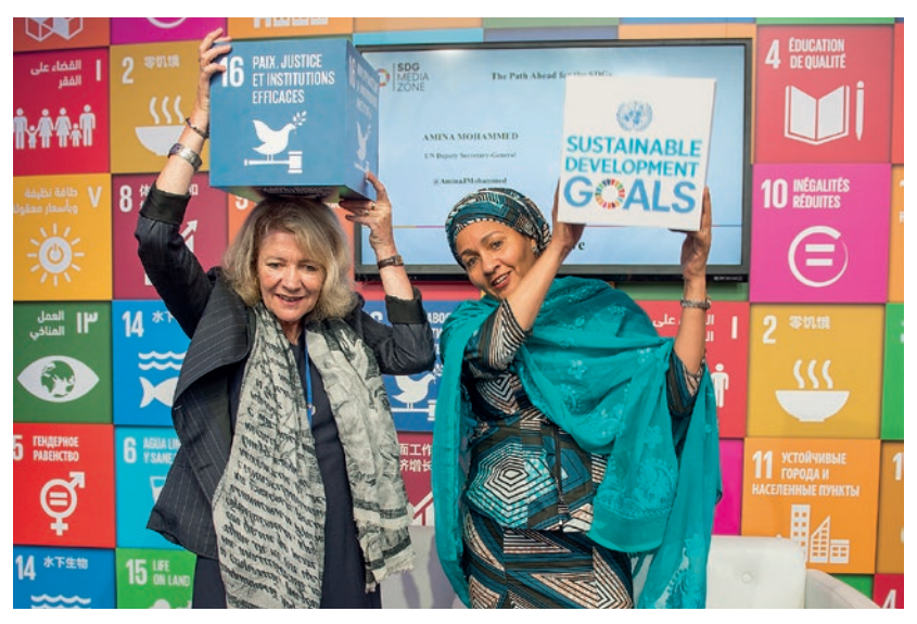
Deputy Secretary-General Amina Mohammed (right) with Alison Smale, Under-Secretary-General for Global Communications, at the SDG Media Zone.

The maintenance of international peace and security is the primary mission for the international system.<sup>4</sup> Given the interconnections between different forms of violence and conflict, effective prevention is only possible if it spans the spectrum of conflict and non-conflict violence. And given the ease with which risks proliferate across borders, a renewed commitment to collective action offers the only path to greater resilience.